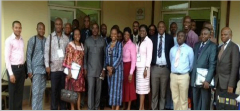
Inauguration of the Society of Pediatric Imaging In Nigeria, SPIN, June 2013

Join us: pediatric radiology societies or groups